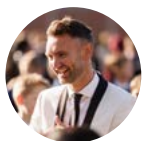
James Miller Junior School Headmaster