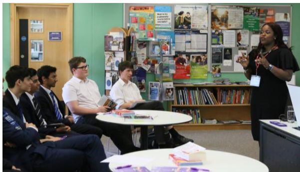
Careers in Law talk from Tuckers Solicitors

Interview rooms and an open access workspace