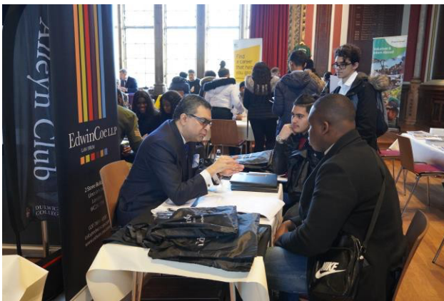
Courses & Careers Convention

Courses and Careers Convention for Year 11, the Remove & the Sixth Form