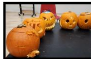
7ST - winners of Fosse Houses' pumpkin carving competition!