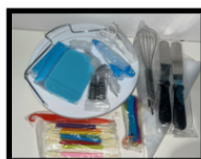
Baking set for cupcake winners!

Enter for a chance to win awesome prizes!