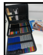
Art set for mascot winners!