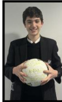
Oscar - 10TB Netball winner!