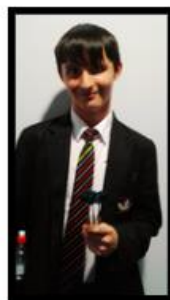
Austin - 10JK 3 Dart challenge winner!