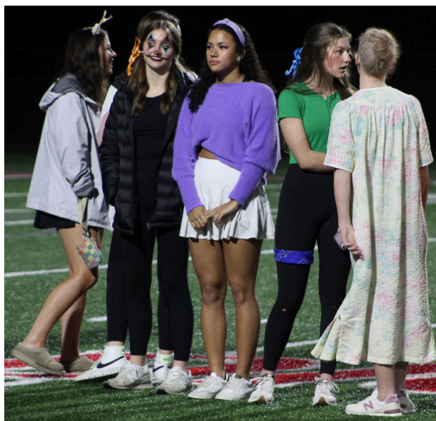
Left: The Halloweeners made it onto the field in the pre-game festivities, as this group of Crockett volleyballers lined up for the Cavs' entrance.