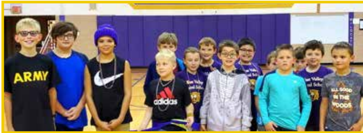
WVCS recognizes the members of Boys on the Right Track.