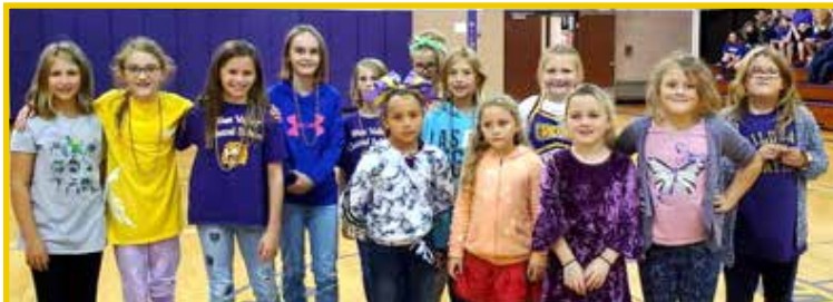
WVCS recognizes participants in Girls on the Run.