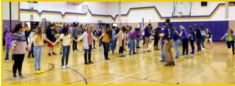
High School students compete in the Hula Hoop Race during Friday's Pep Assembly.