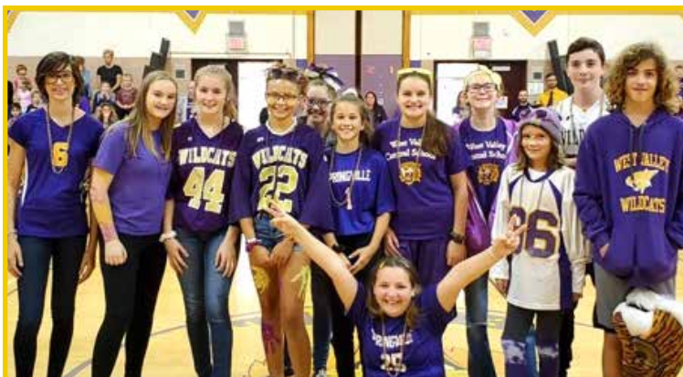
WVCS Student Athletes!