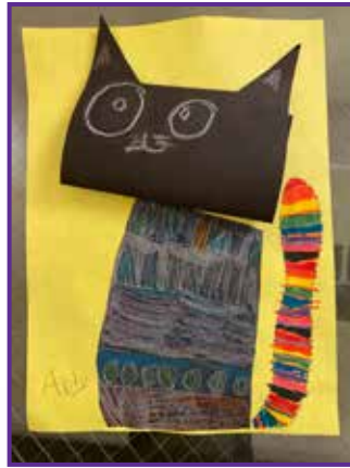
1st Grade Black Cat