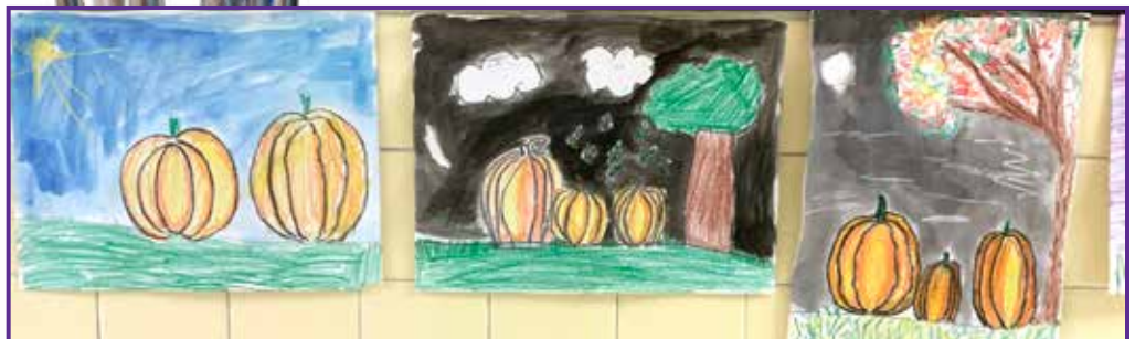
5th Grade Watercolor