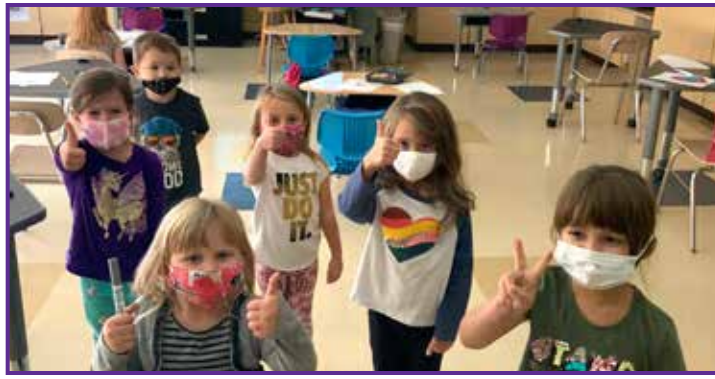
Kindergarten Black Cats