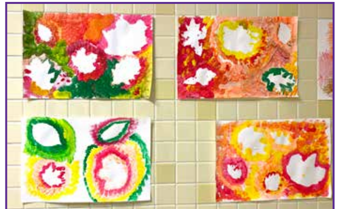
5th Grade Leaf Paintings