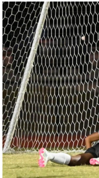
Below:... and reacts in joyous amazement while a South Gibson defender complains about something to any official that will listen.