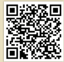
▲ SCAN WITH CAMERA TO ACCESS INFINITE CAMPUS