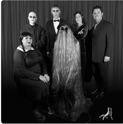
Music and Art Department winners of the staff Halloween costume contest