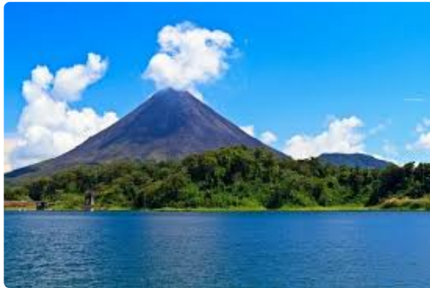
Arenal Volcano: Costa Rica