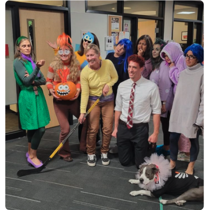
Our Amazing Counselor Team