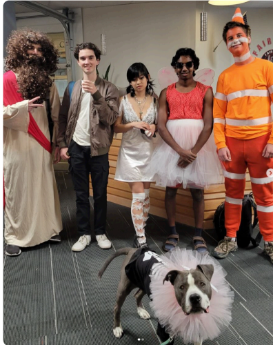
Fairview Knights with Special Guest: Shorty