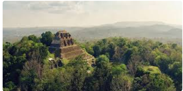
Xunantnich Ruins: Belize