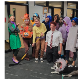
Our Amazing Counselor Team