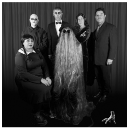
Music and Art Department winners of the staff Halloween costume contest