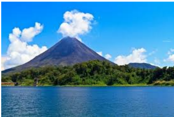
Arenal Volcano: Costa Rica