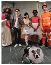
Fairview Knights with Special Guest: Shorty