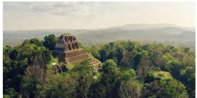
Xunantnich Ruins: Belize