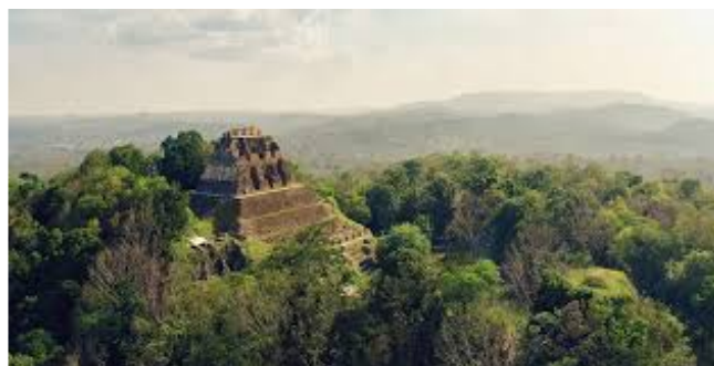
Xunantnich Ruins: Belize