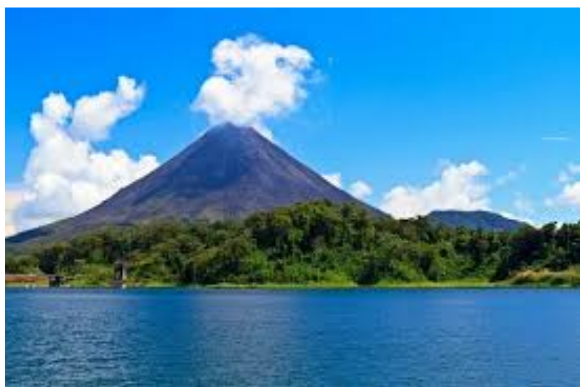
Arenal Volcano: Costa Rica