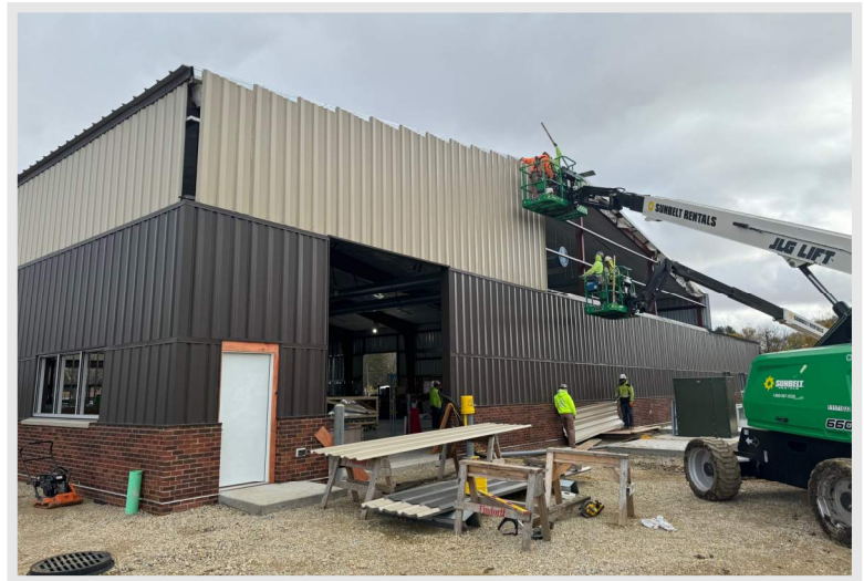
Above: a photo taken as metal panel siding is installed on the west elevation of the Maintenance Building