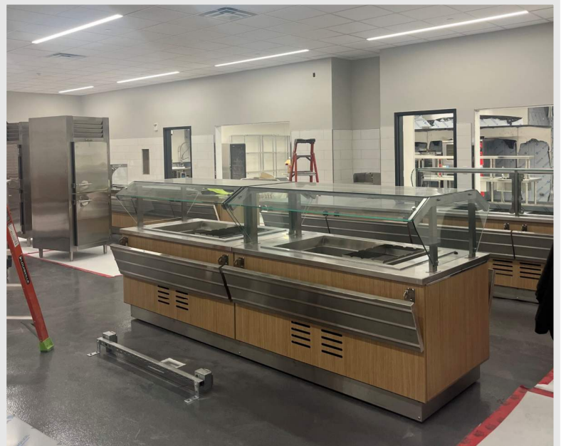
Bottom Right: a photo of the equipment and casework installed in the Servery