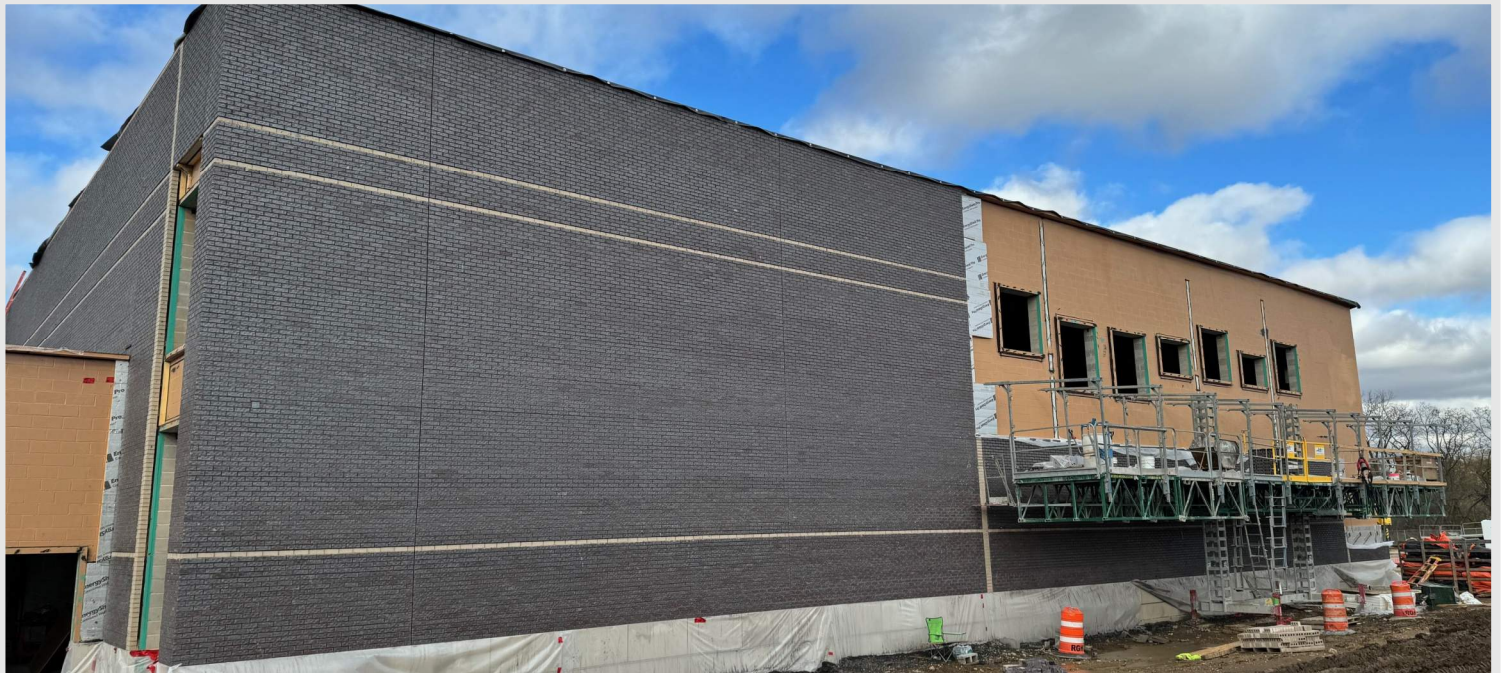
Bottom: a view of the exterior brick wrapping around the River Bluff addition