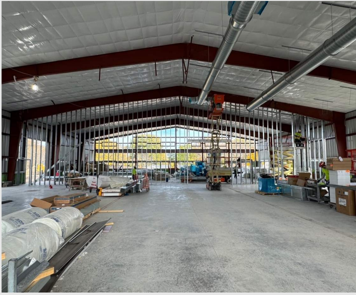
Top Left: a photo of the Maintenance Building shop/garage interior following the completion of the roof overhead