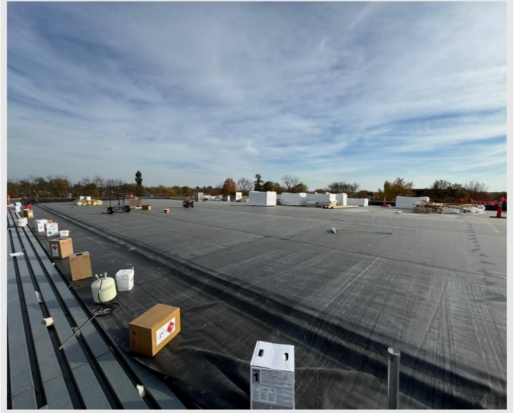
Top Right: a photo of the EPDM roof progress across the River Bluff gym box addition