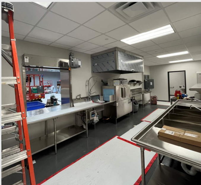
Bottom Left: a look into the Kitchen space following equipment install