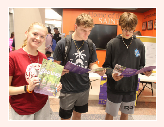
High School students had the opportunity to talk to representatives from 14 local colleges and universities this September during the Rochester Area College Fair. Thank you to the schools who attended and spoke with our students as they think about post-graduation plans.