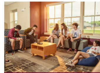
1 - LOUNGE