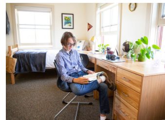
5 - STUDENT DORM ROOM