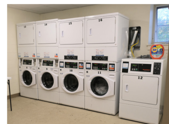
8 - LAUNDRY ROOM