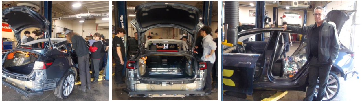
Thanks to Paul Bierker of Allegheny Educational Systems for spending the day with our students and sharing with them the interactive demo electric vehicle used in training automotive students on EV systems.