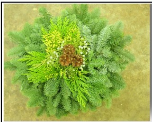
Deluxe Centerpiece $30