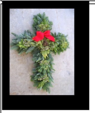
Deluxe Cross $35.00