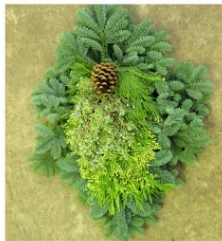
— Swag $35 —