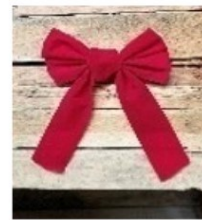
Bow $4-Bows are not included on wreaths.