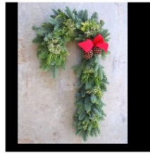
Candy Cane $32