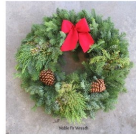
12 Inch-$25 14 Inch-$28 16 Inch-$32