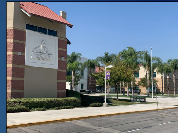
Jurupa Hills High School