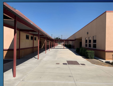
Ted Porter Elementary School