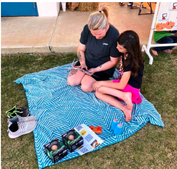
Above: : Another family chose to read a book on their blanket.