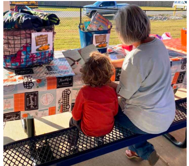
Above: This family shared a book in the warmth of the setting sun.