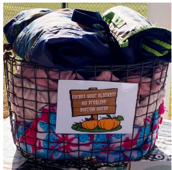
Above: : The ambassadors even brought extra blankets in case a family had not brought its own.