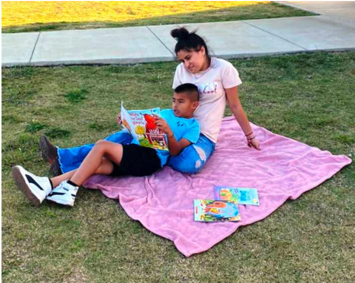
Above: Families were encouraged to bring a blanket to the Blue Cross Healthy Place Park, spread it out, and read a book together.