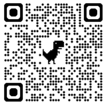
Dallas ISD Attendance + Academics

Dallas ISD encourages all students to “strive for no more than five” absences. Our campus goal is to achieve 98% attendance. Students who miss more than 90% of a course are required to make up seat time through attendance for credit. Families of transfer students and students who are enrolled in the dual language magnet program (6th-8th grade) will be required to work with campus administrators and teachers to develop and adhere to an attendance plan. At the middle school level, attendance is logged in each class period. At the elementary school level, attendance is logged as partial and full-day absences within one instructional day. Students must be present for 90% of the days a course is offered.