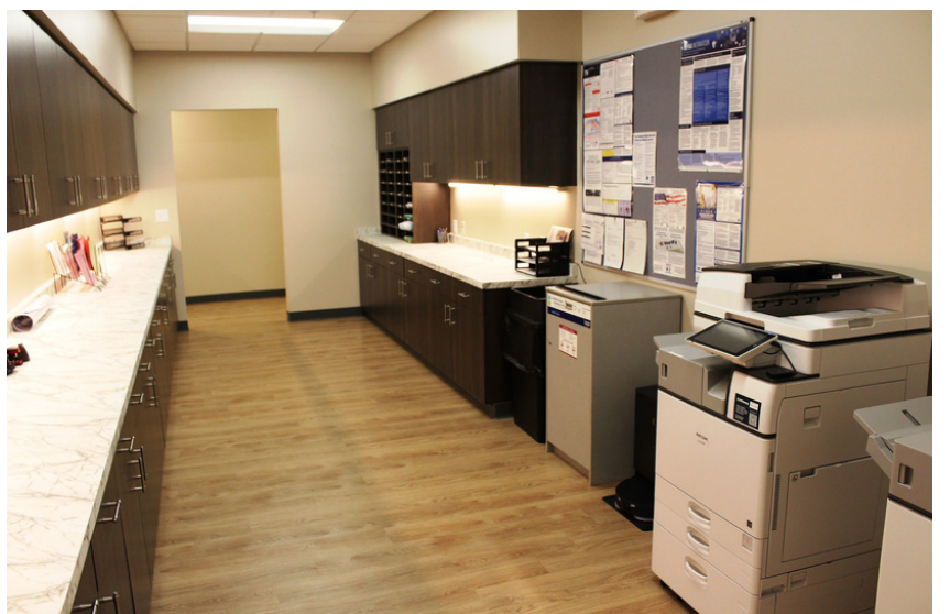
Left:... and a work room for the office staff, as well as individual offices for the district administrative personnel.

Below: The Board Meeting Room is a spacious location with the latest technology available.