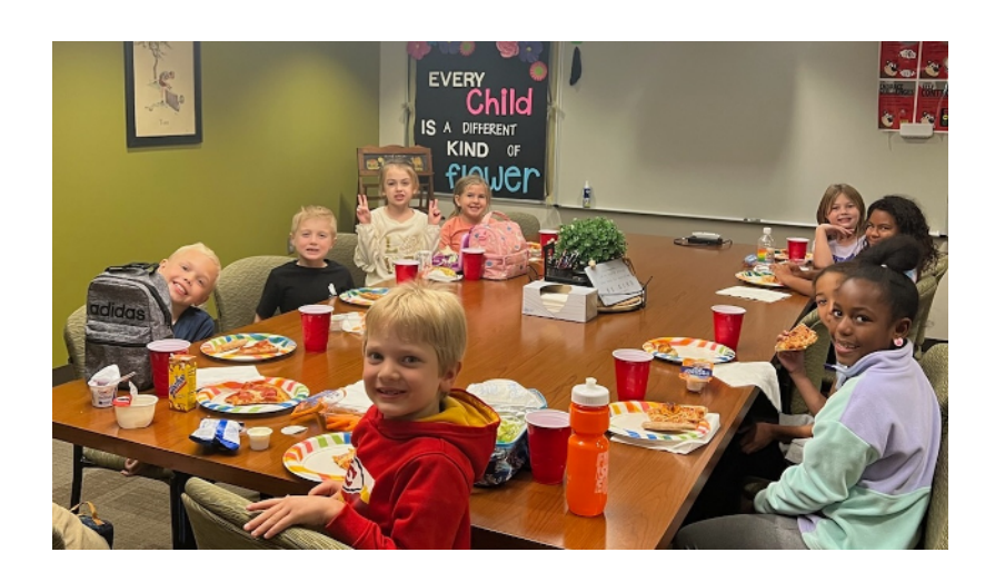
Heusner PTA celebrated the top five sellers of the Fundraiser with a Pizza Party and a friend. Thank you for raising money for our school!