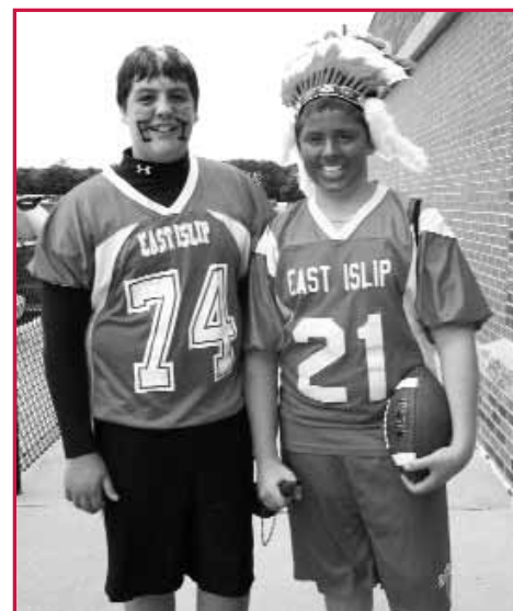
East Islip Middle School students were dressed appropriately (in red) to support the Varsity Football Redmen.