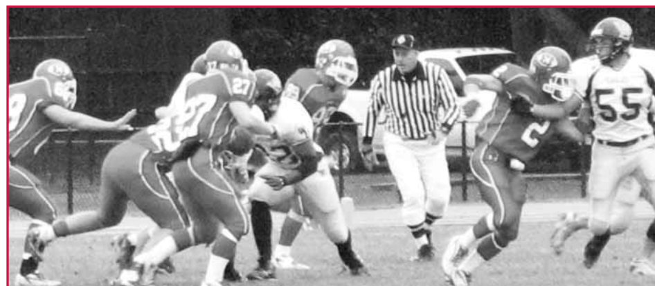
The East Islip Redmen scored a touchdown in the first few minutes of play against West Babylon to cruise to a 21-0 victory.