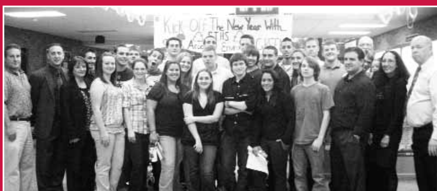
Career Academy members, teachers and advisors gathered to host the big event.