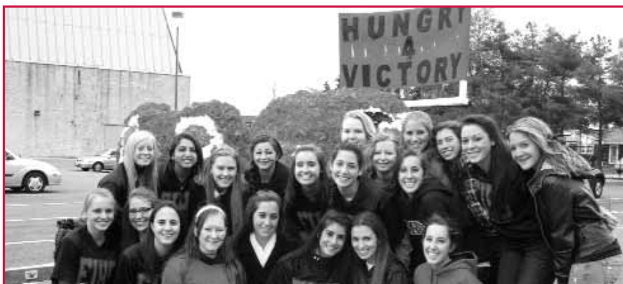
The senior class won this year's float contest with their portrayal of the classic children's game Hungry, Hungry Hippos.