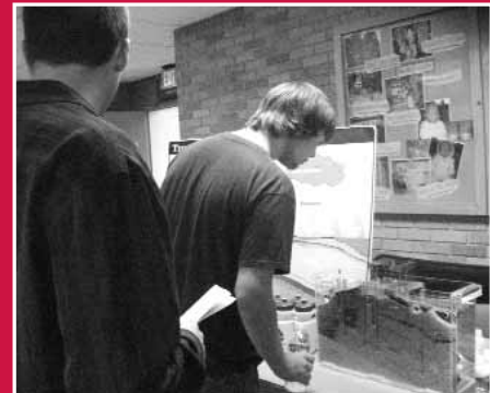
Students witnessed an accurate representation of the water cycle on Long Island.