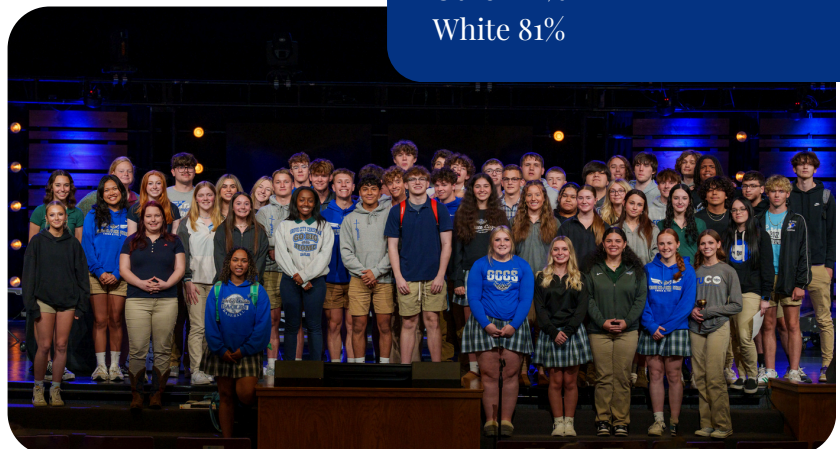
GCCS Senior Class of 2024