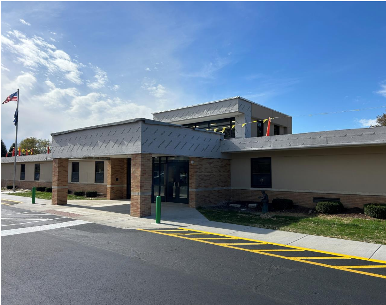
New Clerestory/Roofing Progress