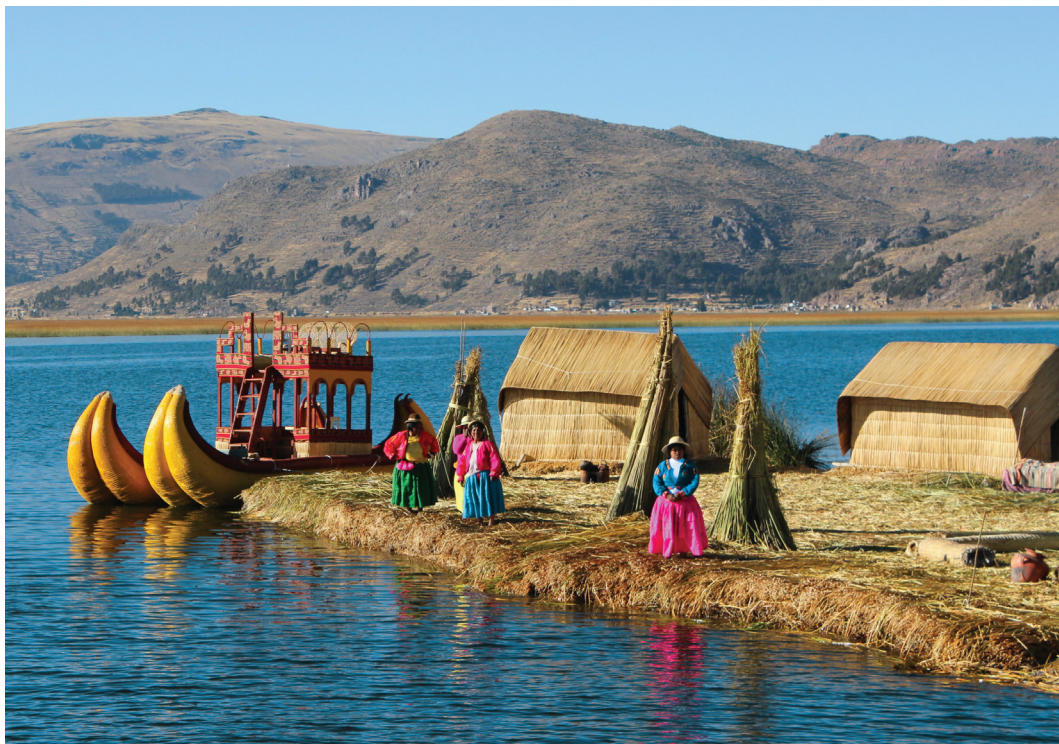
Local women on Uros Island

through the ruins and have the leisure to absorb the beauty and mystery of this haunting UNESCO World Heritage site. Mid-afternoon we return to Aguas Calientes and our hotel, with time at leisure before dinner together tonight. B,L,D