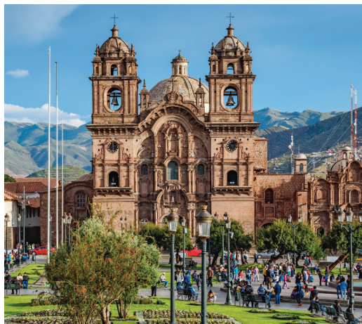
Cuzco, UNESCO site and former Inca capital

Day 11: Arrive U.S. We arrive in the U.S. this morning and connect with our return flight home.