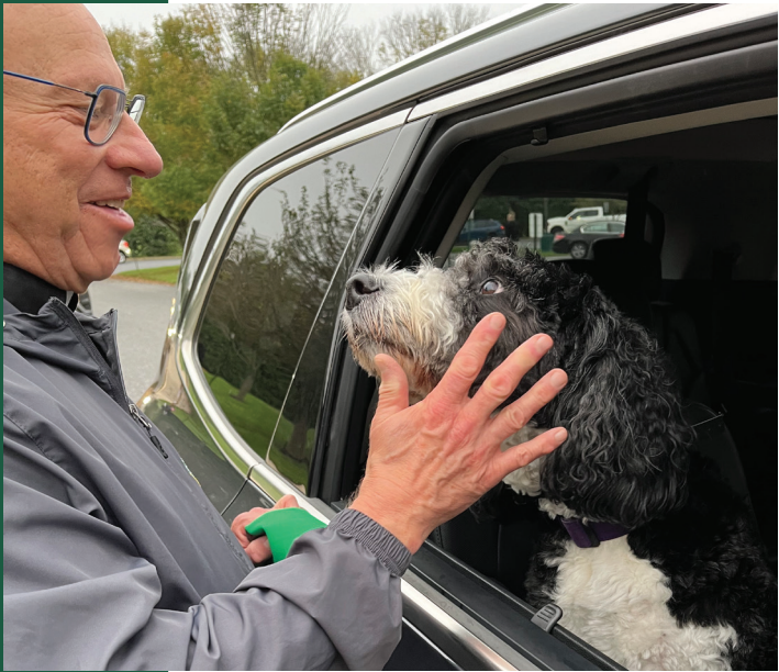
Clockwise: Students cheer on our football team at Warner Stadium, On the feast of Saint Francis, our Chaplain blesses our family pets, Students compete for the title of "Mr. Viking", Faculty and Staff serve students for the annual Thanksgiving meal, Seniors enjoy the Senior Sunrise" together, and students decorate the Great Hall Christmas Tree.