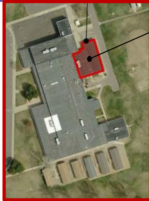
Con Ball MS