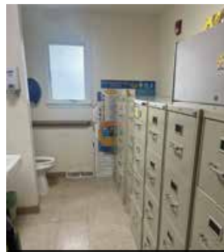
Some student files are stored in the restroom due to lack of space