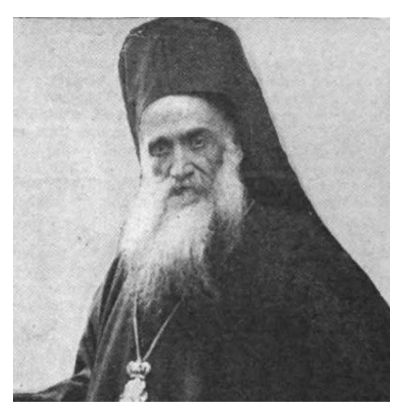
Metropolitan Dorotheos of Prusa, Locum Tenens of the Ecumenical Patriarchate

In May 1919, the Pan-Syrian Congress, the first-ever national parliamentary body in Syria, met in Damascus. On May 15, Greek troops landed at Smyrna, and the following day, the Ecumenical Patriarchate threw its lot in with Greece, declaring that Ottoman Greeks were now released from their civic duties to the Ottoman state. Henceforth, the Patriarchate would assume complete sovereignty over the Ottoman Greek community.<sup>5</sup>