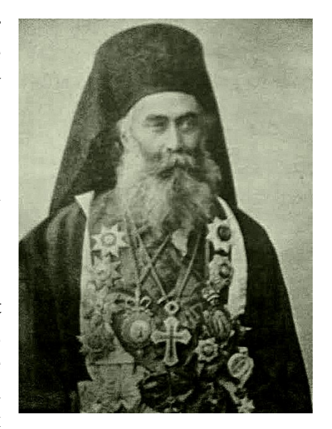
Patriarch Damianos of Jerusalem

flowing into Palestine, Orthodox schools and other institutions were forced to close. Furthermore, the Patriarchate was cut off from income from its property holdings in Bessarabia and Wallachia. In May 1918, the Brotherhood of the Holy Sepulchre declared its intentions to hand over full control of the Patriarchate's administrative and financial affairs to the Greek government, which insisted upon the deposition of Patriarch Damianos. The Brotherhood complied, and in September, they deposed Damianos. However, the British government, which controlled Palestine, would not recognize Damianos' deposition and wouldn't allow the Greek government a free hand in the Patriarchate. The British did arrange for the sale of many properties of the Patriarchate - and many of the buyers were Jewish companies. This was the beginning of the sell-off of Orthodox lands to Jewish settlers - a problem that has continued to plague the Patriarchate to this day.