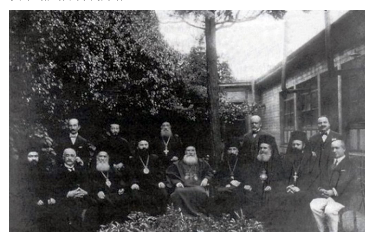
Pan-Orthodox Congress of 1923

Just after the Pan-Orthodox Congress ended, Patriarch Tikhon was set free from house arrest. He initially announced that the Russian Orthodox Church would adopt the calendar reforms of the Congress, although the Russian Orthodox people mostly rejected this, and in the end, the Russian Church retained the Old Calendar.