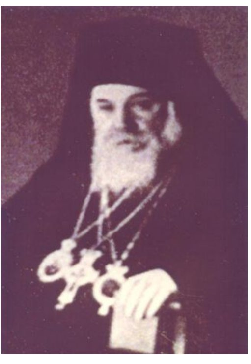
Ecumenical Patriarch Constantine VI

In December 1924, the Ecumenical Patriarchate was about to elect a new Patriarch. The top contender was Metropolitan Constantine of Derkos. This was a problem, because Constantine had only moved to Istanbul in 1921, which was after the October 1918 deadline set by the Lausanne Treaty – all Greeks who were residents of Istanbul in October 1918 were exempt from deportation, but any who arrived later could be deported. The Turks briefly arrested Constantine and two other candidates, and the Greek consul in Istanbul begged the Holy Synod to postpone the election. But they refused, and the next day, Constantine was elected Ecumenical Patriarch. The Turks insisted that Constantine was still going to be deported.