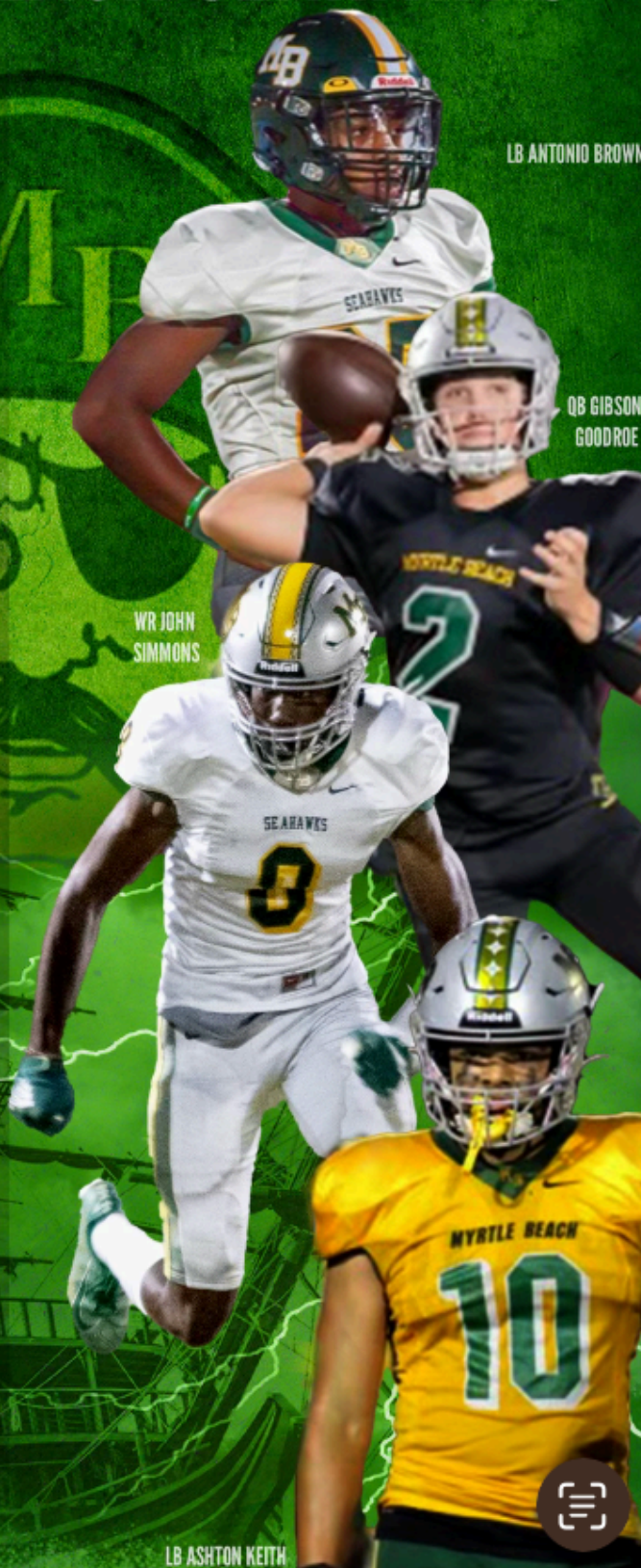
LB ANTONIO BROWN