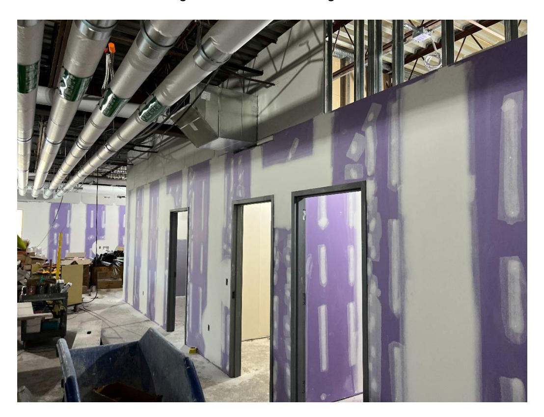
Segment \ F-ID \ Room \ Drywall \ Taping/Interior \ Painting \ in-progress.