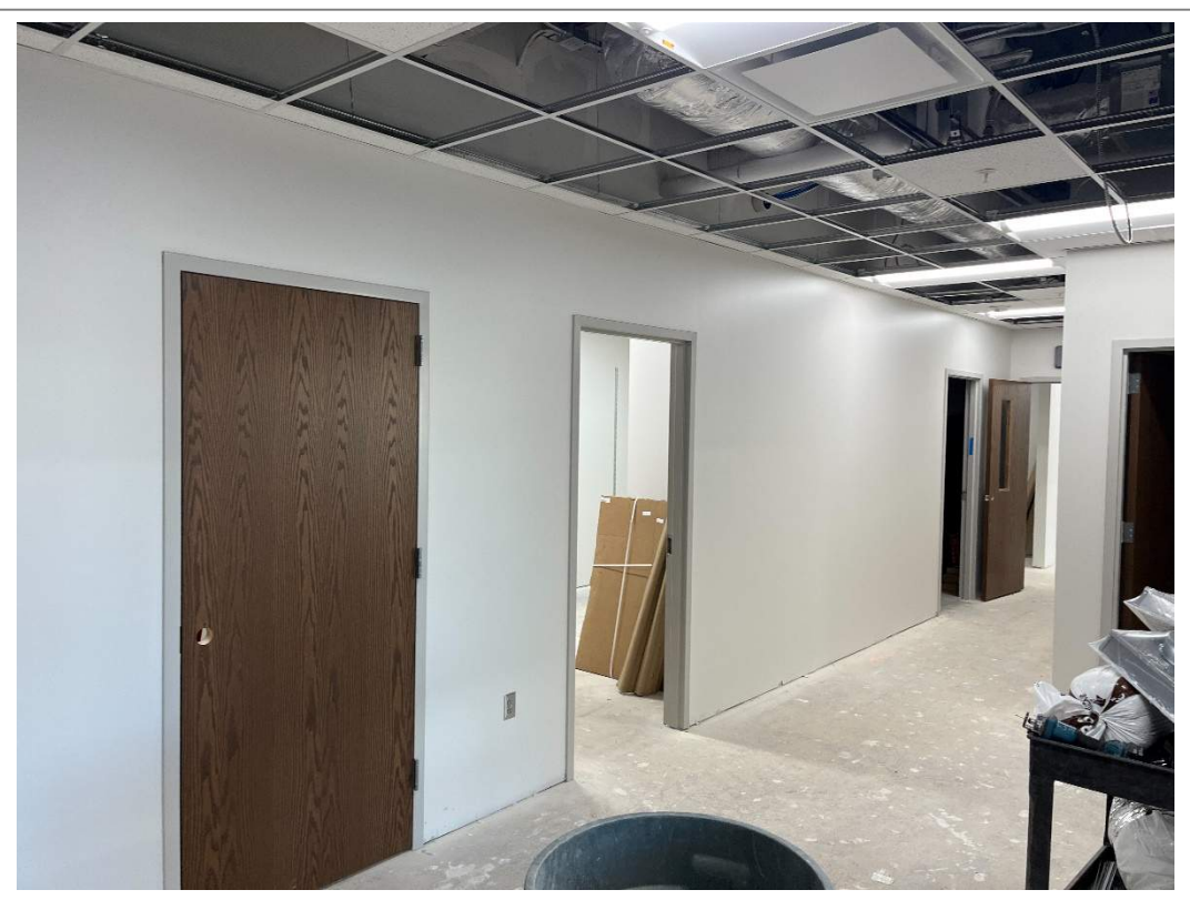
Segment D Admin Area – Door and Hardware Install In-Progress