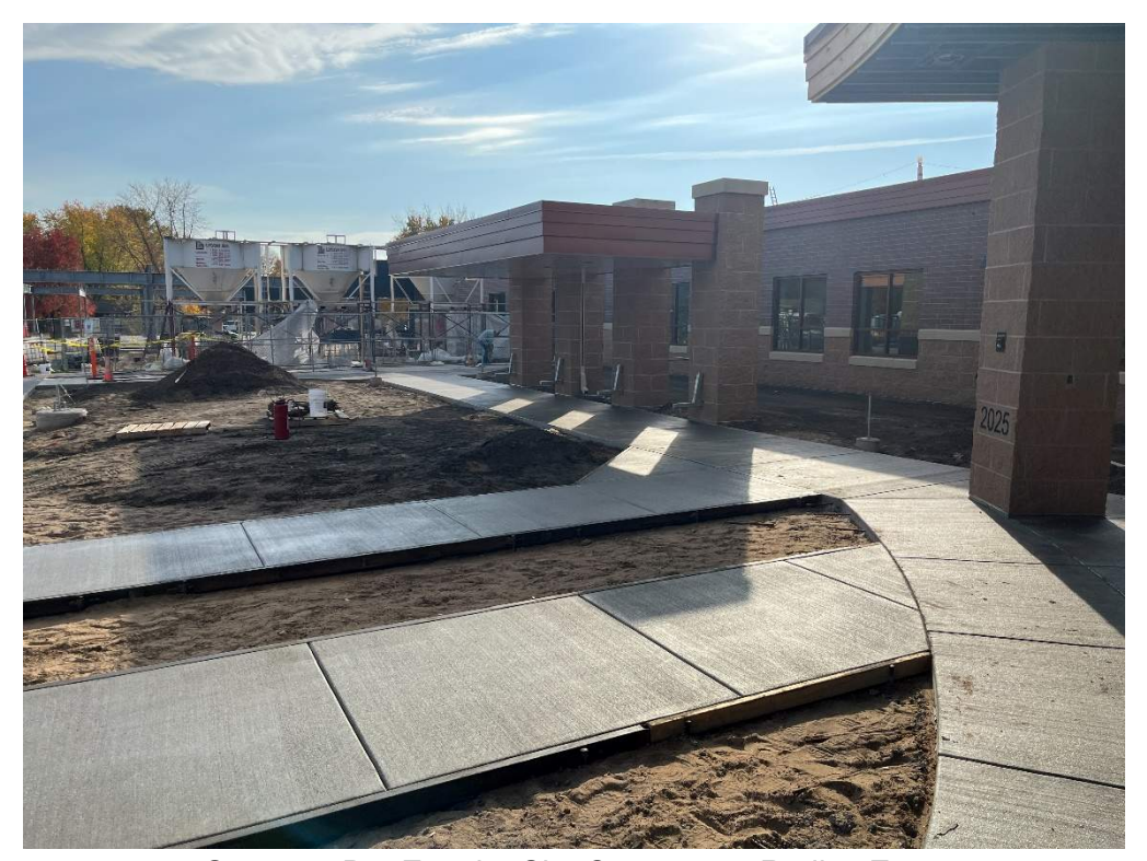
Segment D – Exterior Site Concrete at Radius Entry