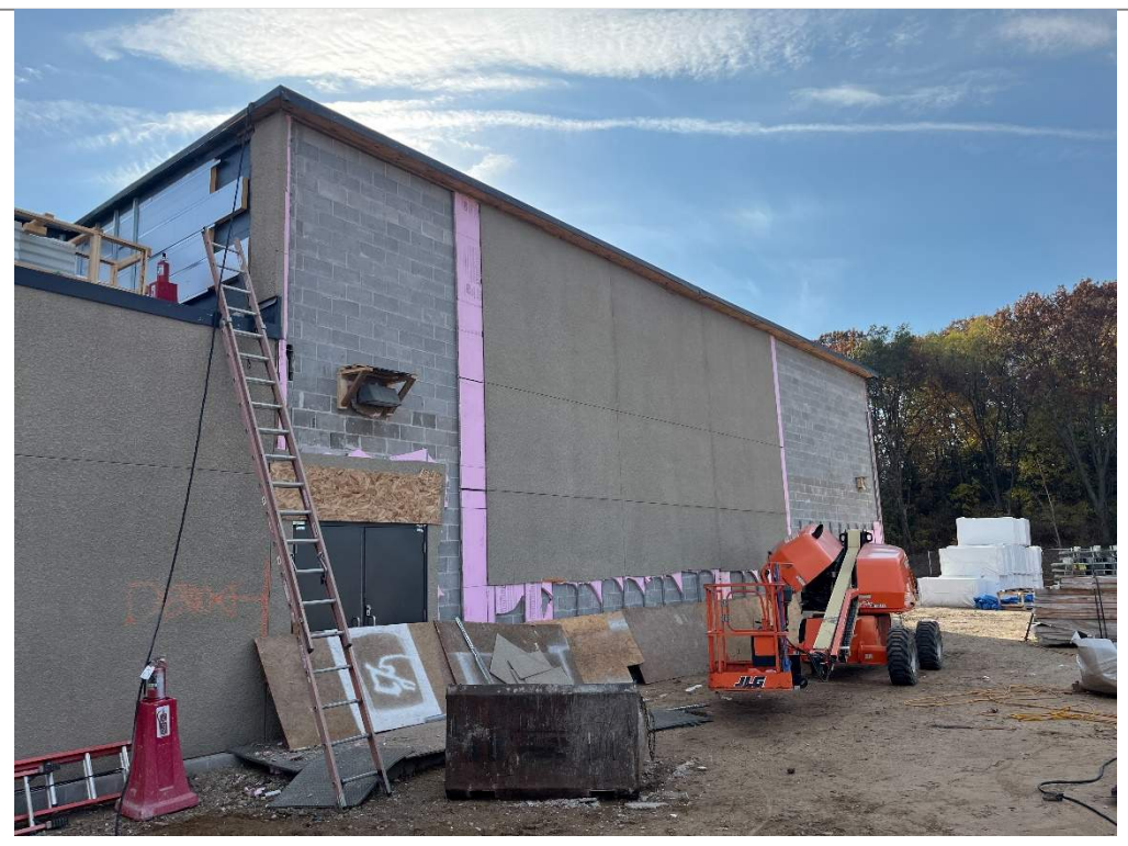
Segment A Existing Art Room – Exterior Demolition (Phase 3A)