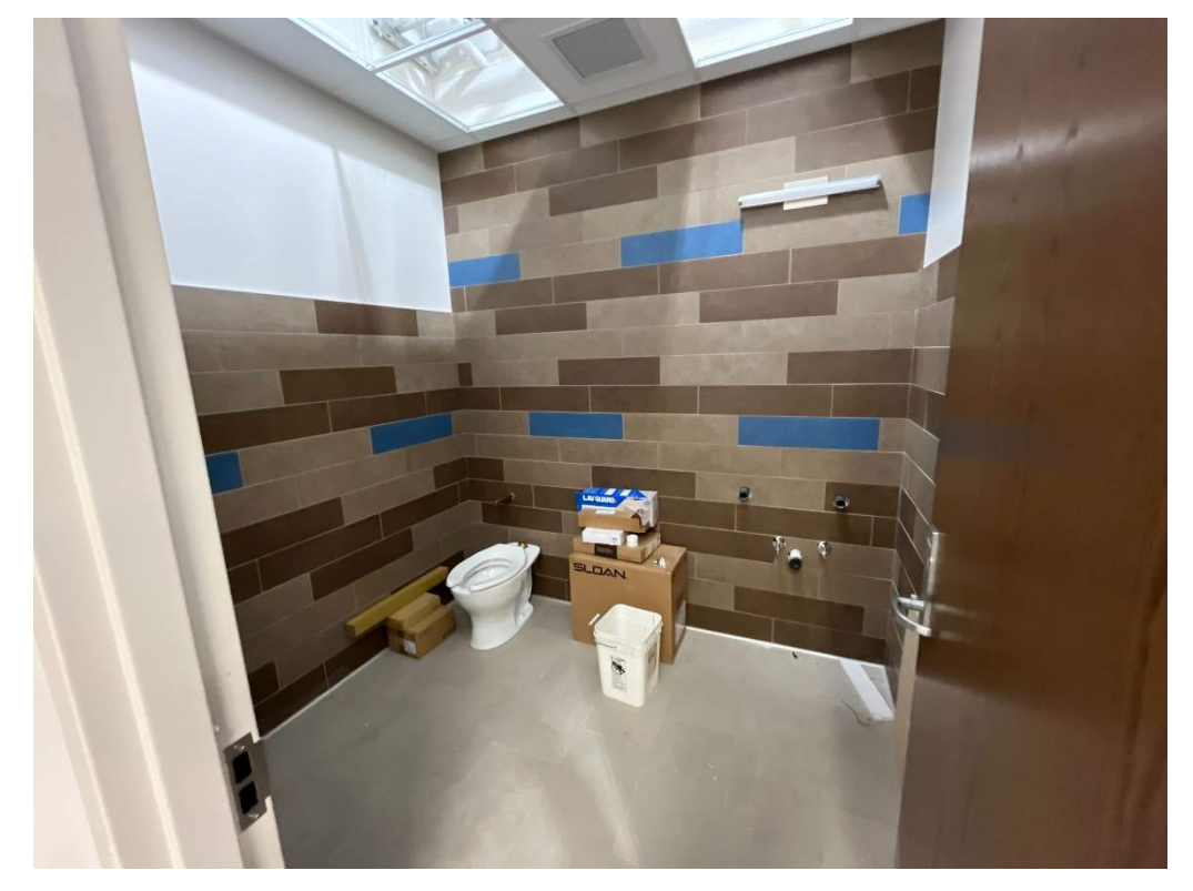
Segment D Admin Area – Tilework In-Progress