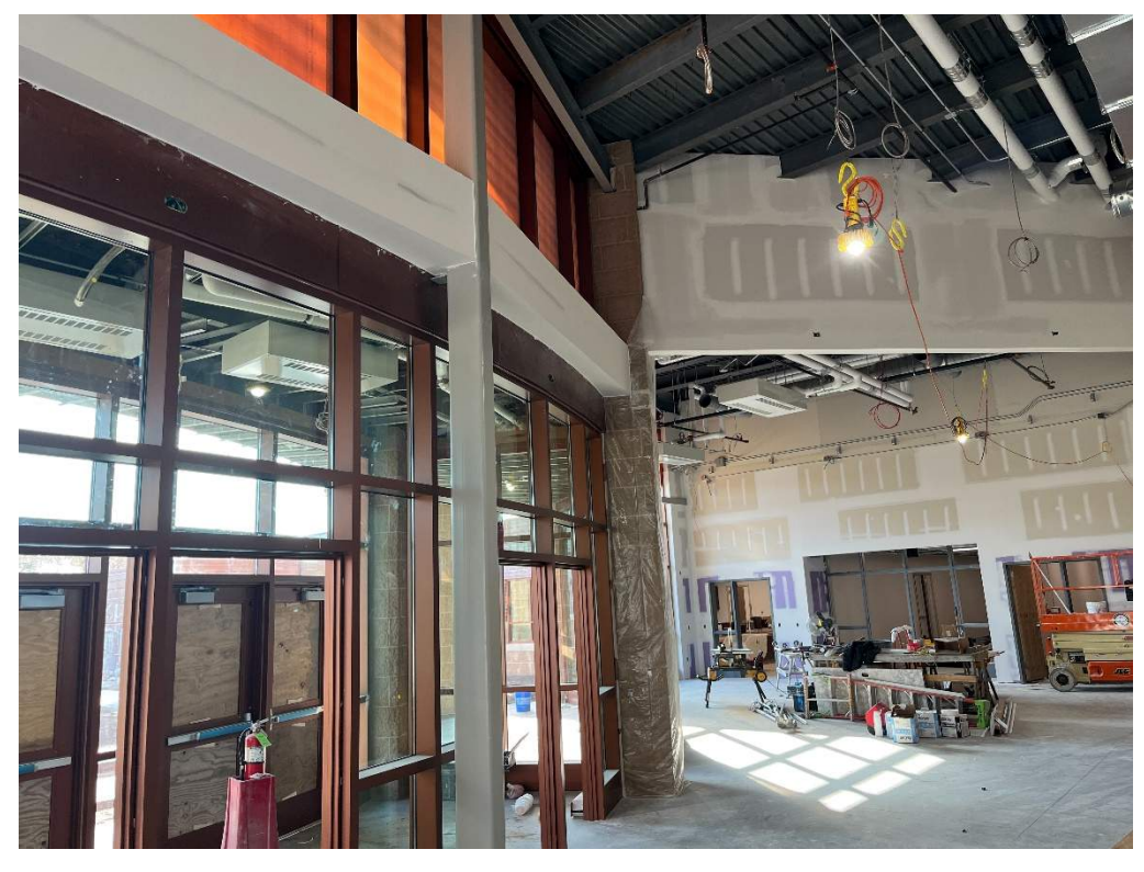
Segment D Radius Entry – Drywall Taping in-Progress