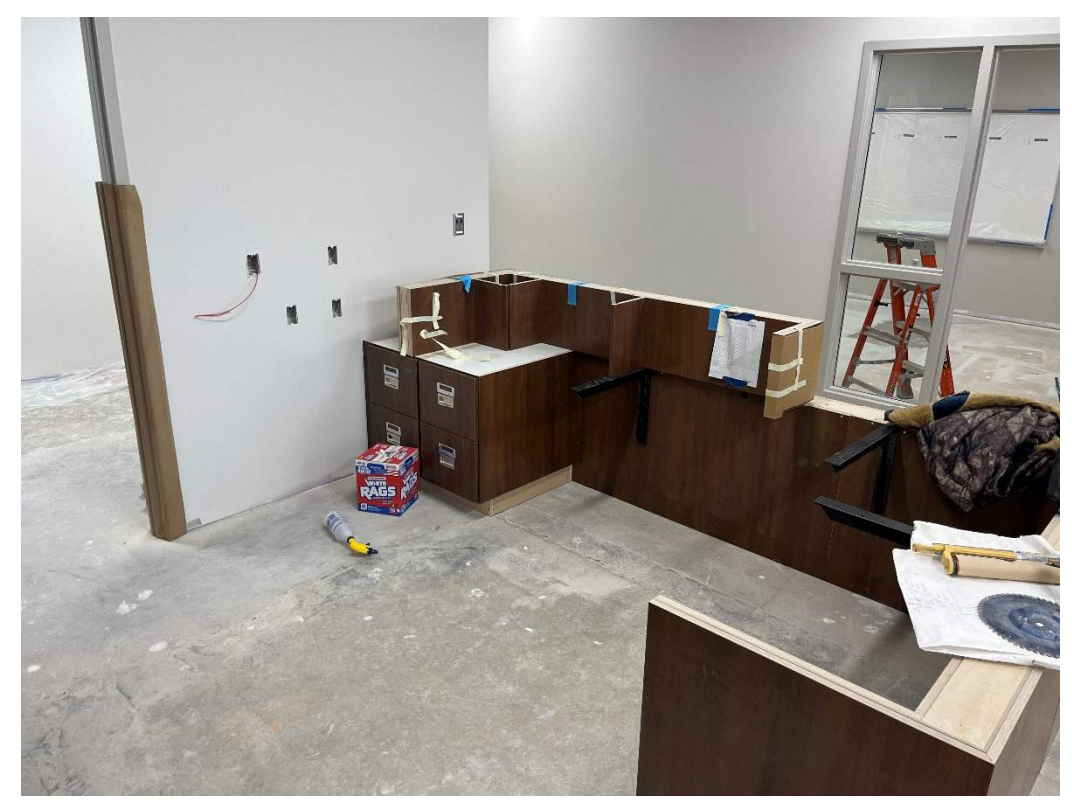
Segment D Admin Area – Reception Area Casework Install In-Progress