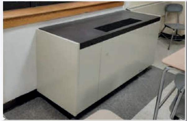
New unit ventilators will significantly lower building energy costs