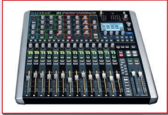
Exemplary professional-grade soundboard and mixer

At our secondary schools, a major portion of the lighting and sound technology in our auditoriums and performance spaces are outdated, inefficient and below what today’s industry standards are for musical and theatre productions. Updates are proposed for the following: