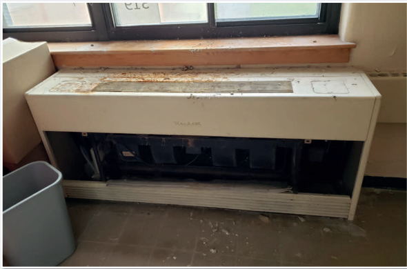
Decades old unit ventilators are cost-inefficient and costly to maintain