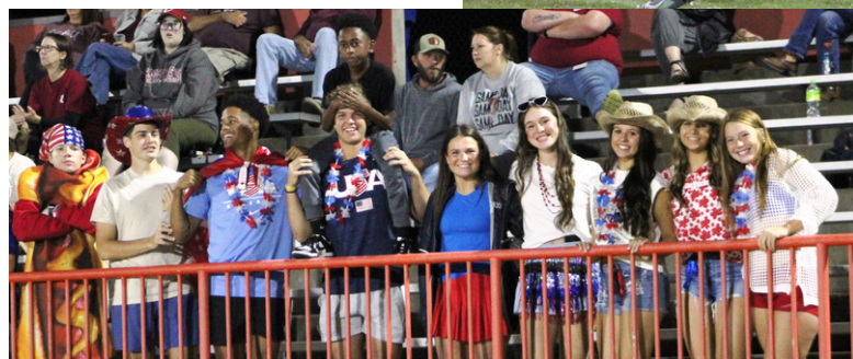
Left: Some of the Crockett students showed up in their red, white, and blue regalia to cheer on the Cavaliers.