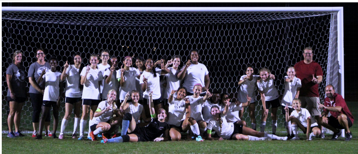
Above: And when it was all over, Crockett County Middle School had won its first-ever district championship in girls soccer. And on its arch-rival's field.