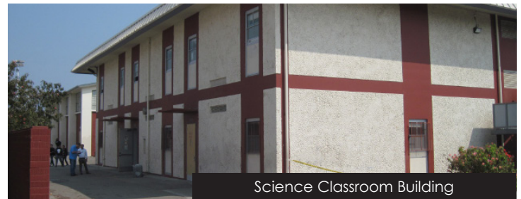
Science Classroom Building

This project includes a new practice gymnasium building which also includes a girls' locker room, dance studio, and weight room, as well as the seismic upgrade and accessibility retrofit of the existing Science Classroom Building. An exciting new element is the addition of a student quad between the two buildings and leading towards the entry of the stadium, which will provide a place to gather and a setting for outdoor learning activities. The project is being delivered using the design-build method.