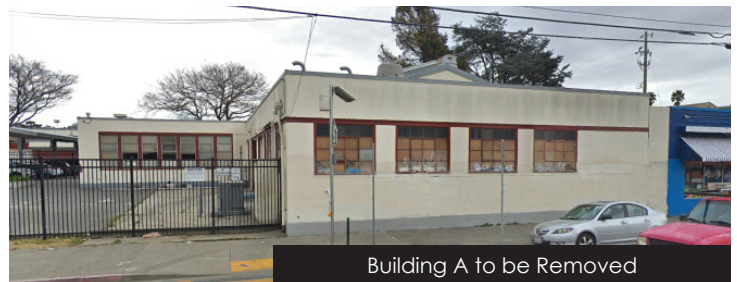
Building A to be Removed