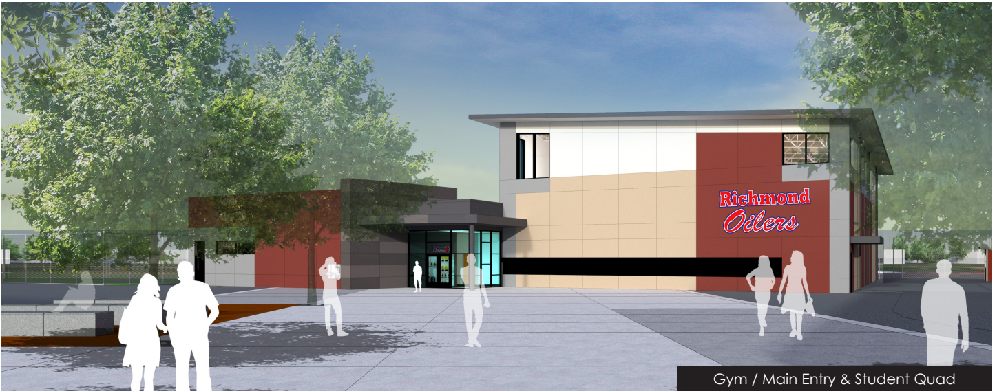
Gym / Main Entry & Student Quad