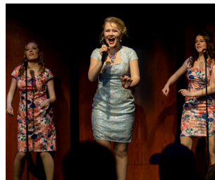
See a show

Become a Laker! Enroll today at www.plsas.org/enroll