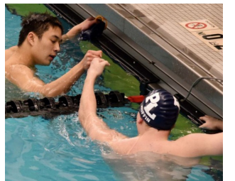
Go to a sporting event