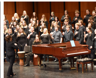
Enjoy a concert