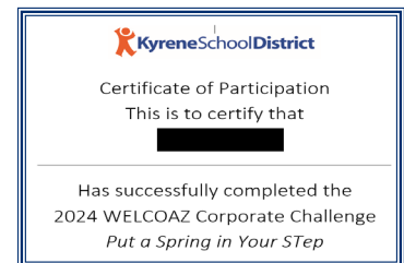
WELCOAZ Certificate of Completion