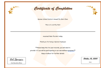
Flu Shot Certificate of Completion

So, go ahead and schedule those appointments. Your future self will thank you! Let's keep shining and stay on top of our health game.