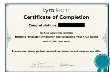
Lyra Learn Certificate of Completion