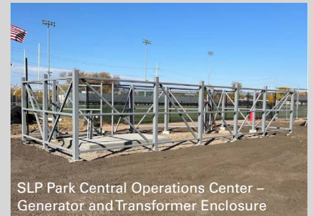
SLP Park Central Operations Center – Generator and Transformer Enclosure