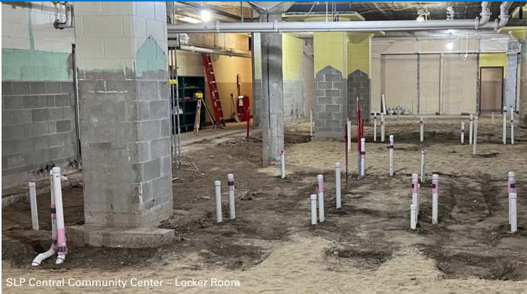
SLP Central Community Center – Locker Room