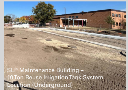
SLP Maintenance Building – 10Ton Reuse Irrigation Tank System Location (Underground)