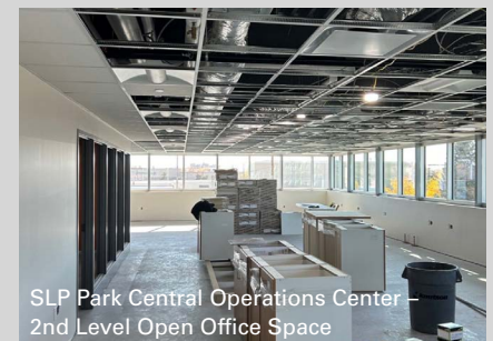
SLP Park Central Operations Center – 2nd Level Open Office Space