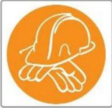
BUILDING & TRADES