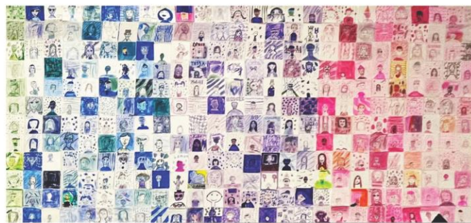
Chesterfield's Rainbow Connection 2024-2025 K-6th Grade