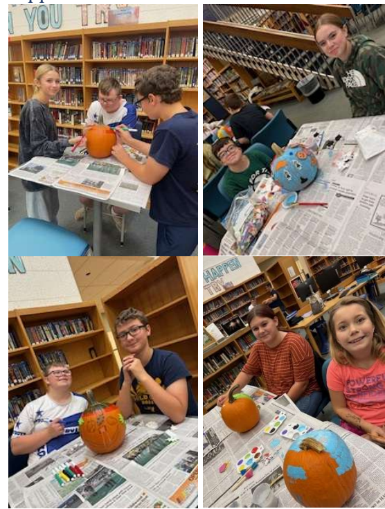
Pictured above: Students in the Middle School's Peer Buddy Club enjoyed some pumpkin painting at their last meeting.

We look forward to recognizing our deserving students, fostering a spirit of appreciation within our school community, and engaging with all of you during conferences. Thank you for your continued support!