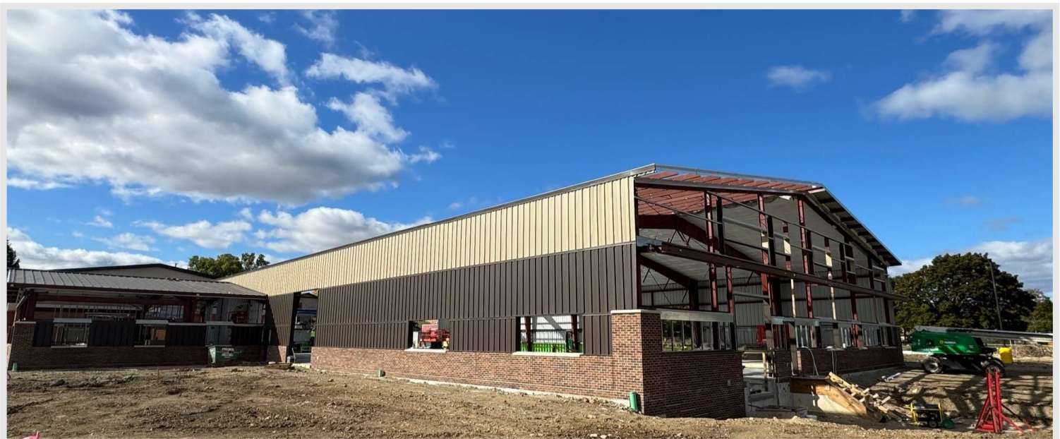
Bottom: a photo of the overall progress at the Maintenance Building on the Yahara Site as metal roof and wall panels are installed