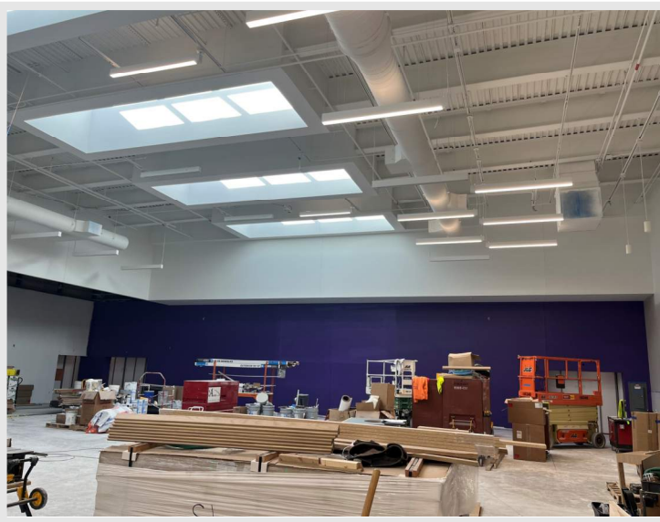
Bottom Left: a view of the overall progress across the High School Commons space as finishes go into place