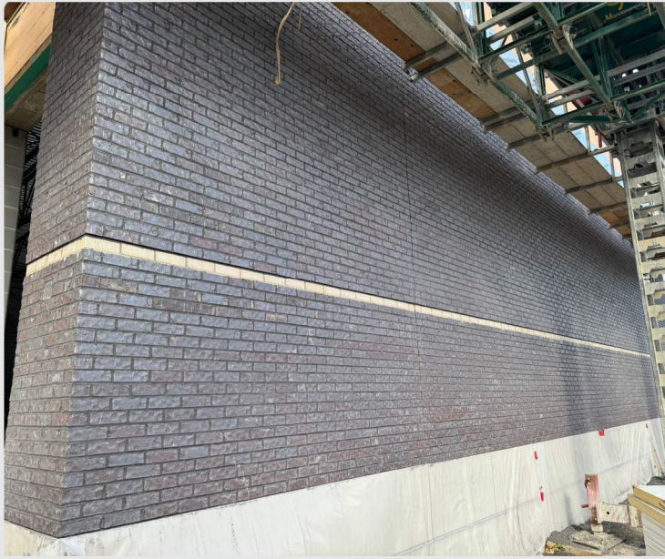
Top Left: a first look at the finished brick façade wrapping the River Bluff addition

//////////////////// City of Stoughton, Wisconsin ////////////////////// 10/18/24