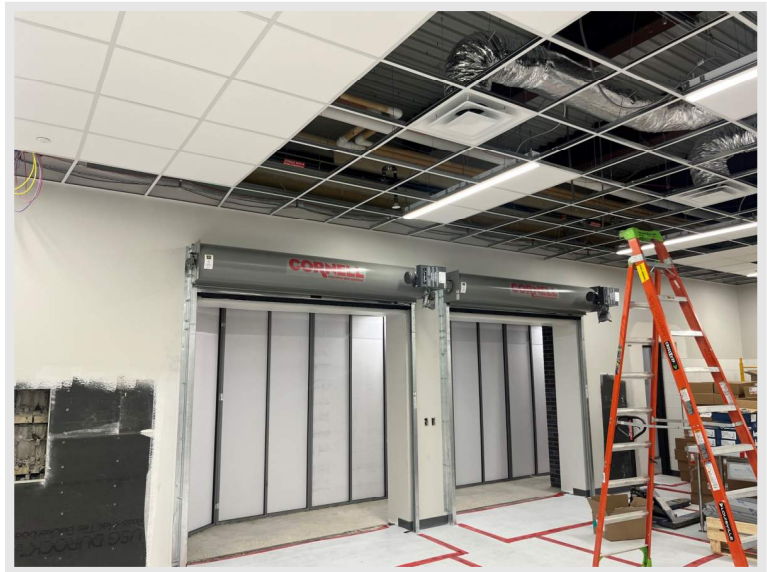
Bottom Right: a photo taken following install of the coiling doors at the entrance to the Servery space