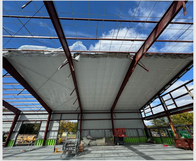
Top Right: a photo taken as the first few bays receive metal roof panels and insulation at the Maintenance Building