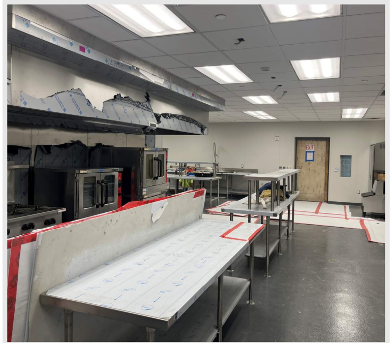
Top Right: a first look at the new kitchen amenities

It was a big week in the kitchen and servery spaces as all the stainless-steel kitchen equipment was delivered and installed. Following final plumbing and electrical hook-ups, the space will be ready for use after cleaning and inspections! Finishing touches on paint and tile are also underway in the space and installation of the heavy-duty coiling doors is complete at the entrance to the server.