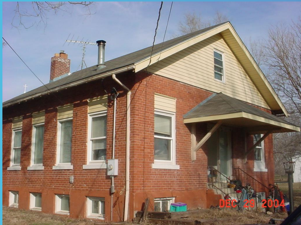
← Piper Elementary, 1905

In 1905 a new brick school was built at 12112 Russell in the town of Piper. This building was in use until the mid-1950's when it was replaced with a one-story brick school building with three rooms on an acre of land located at 12036 Leavenworth Road, Piper, Kansas.