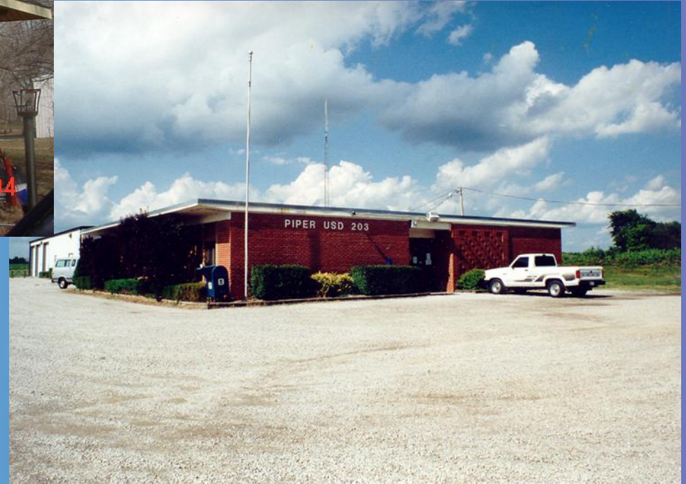
Piper Elementary, 1950's →