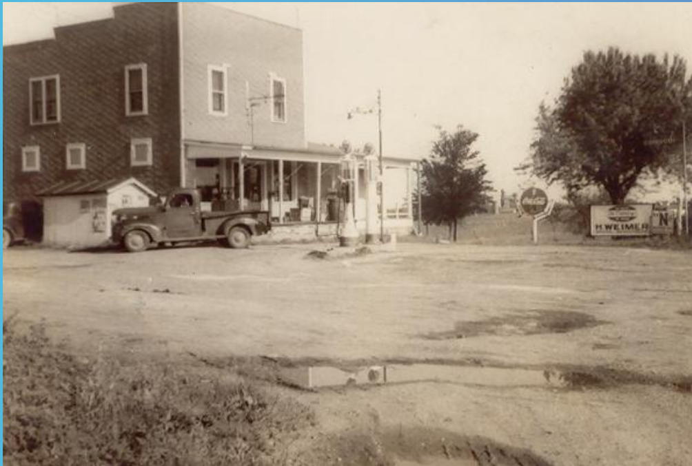
Store at Wallula