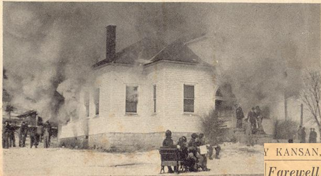
Y KANSAN, WEDNESDAY EVENING, JANUARY 7, 1942