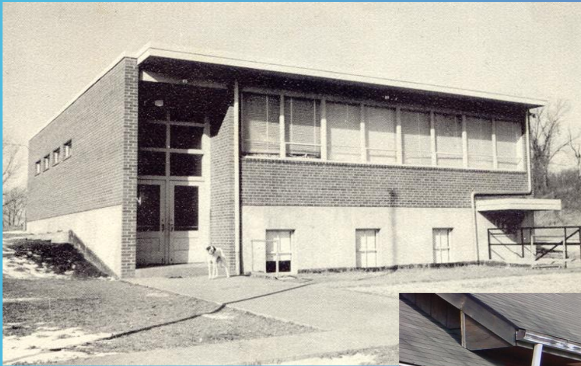
← Brauer Elementary School