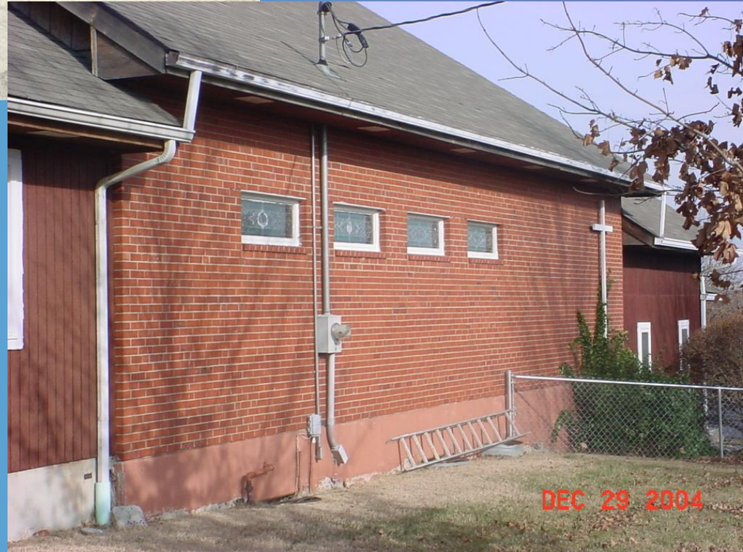
Wy. Co. Christian Church →