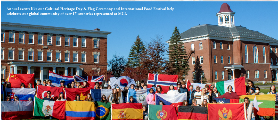
Annual events like our Cultural Heritage Day & Flag Ceremony and International Food Festival help celebrate our global community of over 17 countries represented at MCI.