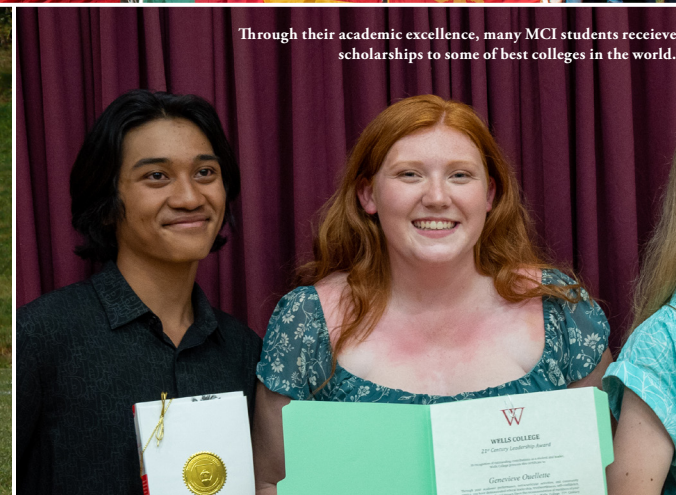
Through their academic excellence, many MCI students receive scholarships to some of the best colleges in the world.