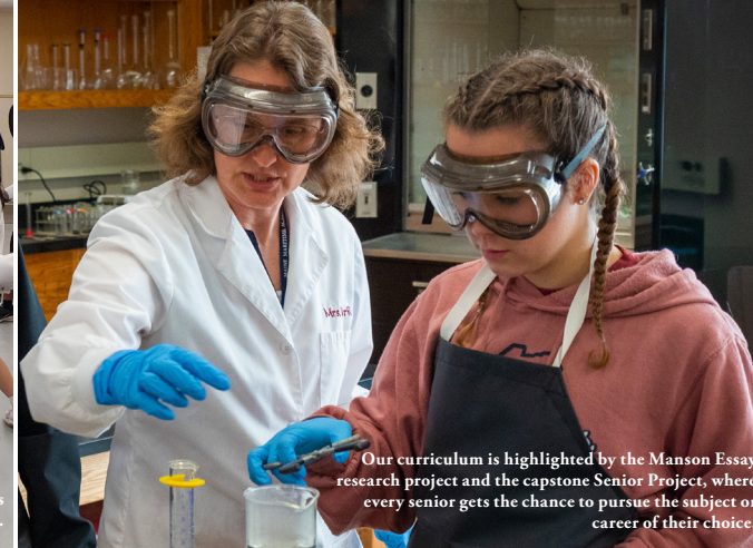
Our curriculum is highlighted by the Manson Essay research project and the capstone Senior Project, where every senior gets the chance to pursue the subject or career of their choice.