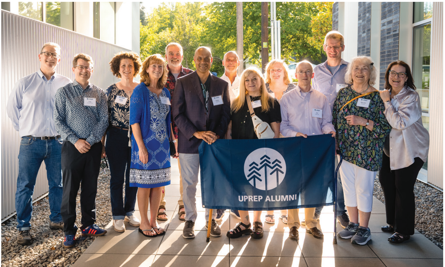
The class of 1984 celebrated their milestone reunion on campus in June 2024.

When invited to provide more information, alumni said they value UPrep for: