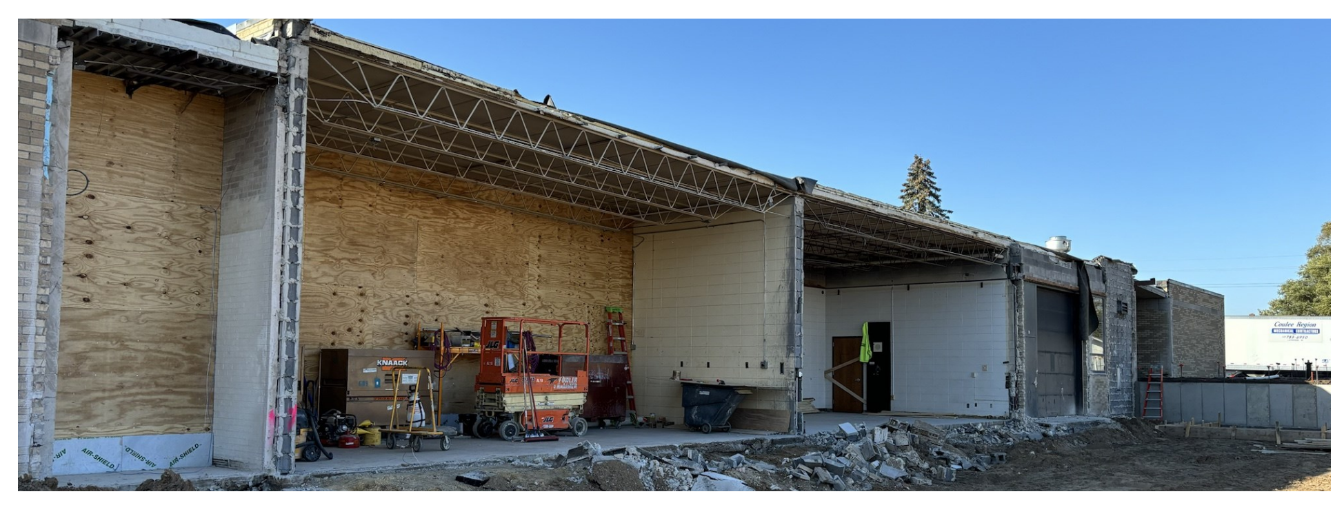
CONTINUED DEMO TO EAST SIDE OF THE BUILDING