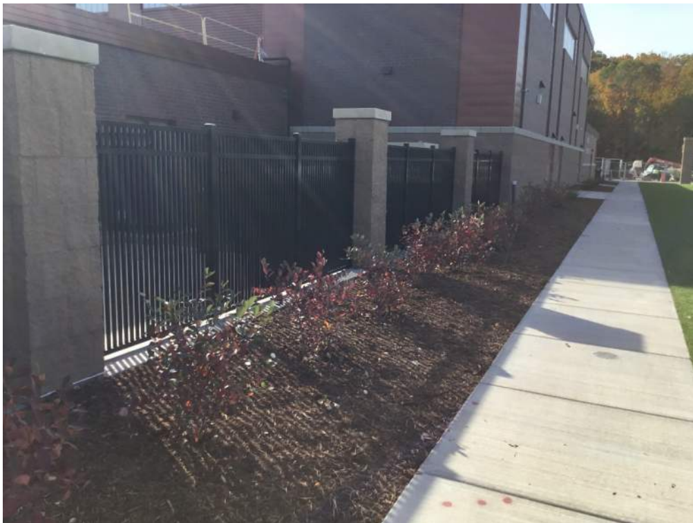
North Exterior Site – Landscaping in Progress