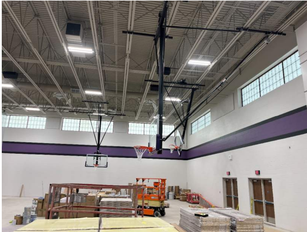
Segment B – Overhead Gym Equipment Install