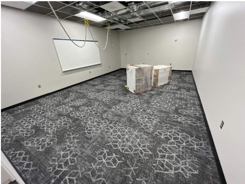
Segment D – B&G Club Flooring Install & Finishes Ongoing