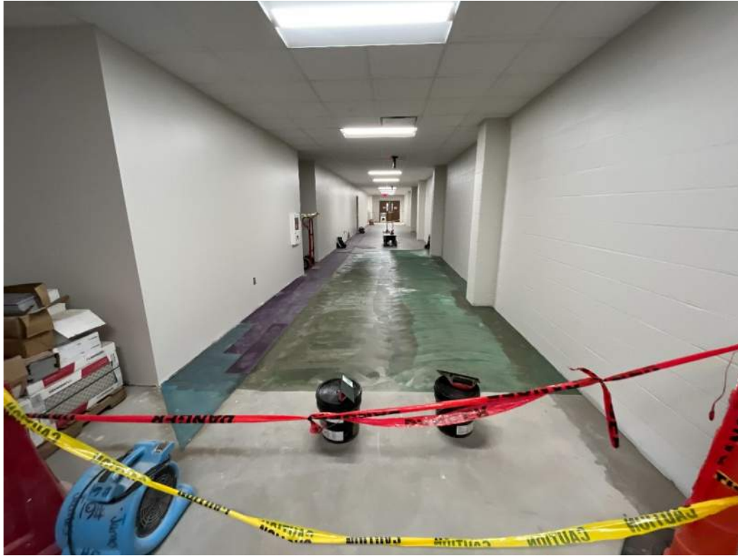
Segment D – Corridor 158 Flooring Installation In-Progress