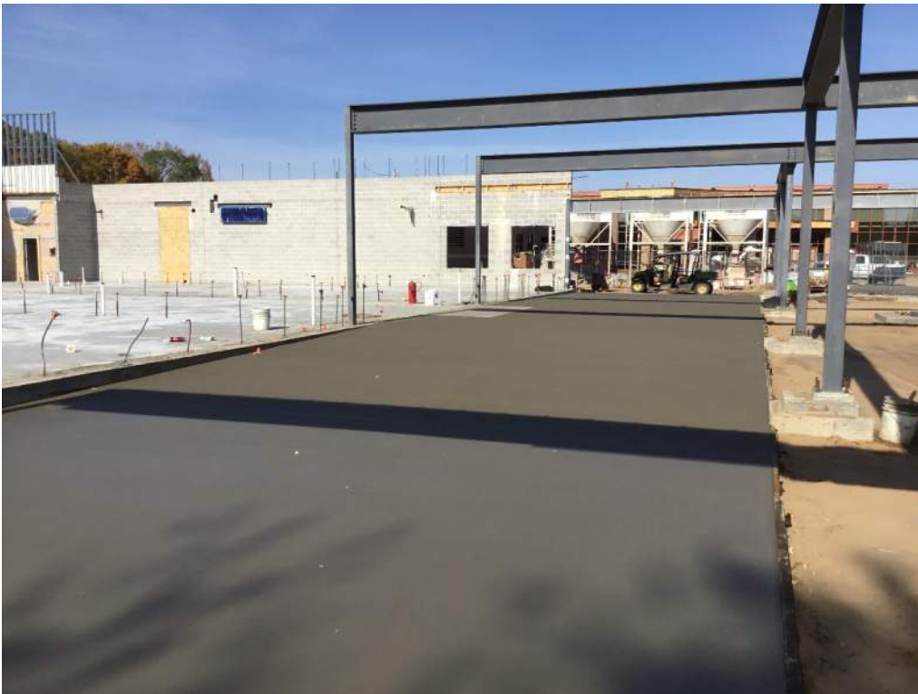
Segment F Classroom Addition – Overhang Canopy Exterior Site Concrete Poured