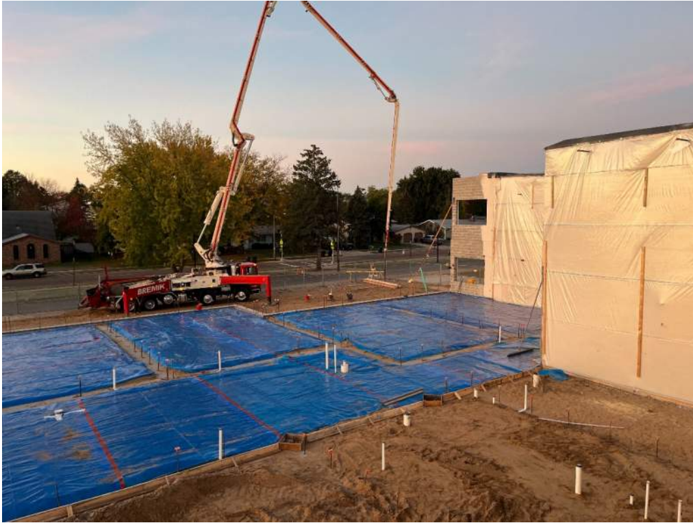
Segment F Classroom Addition – Slab-on-Grade Prep and Pour