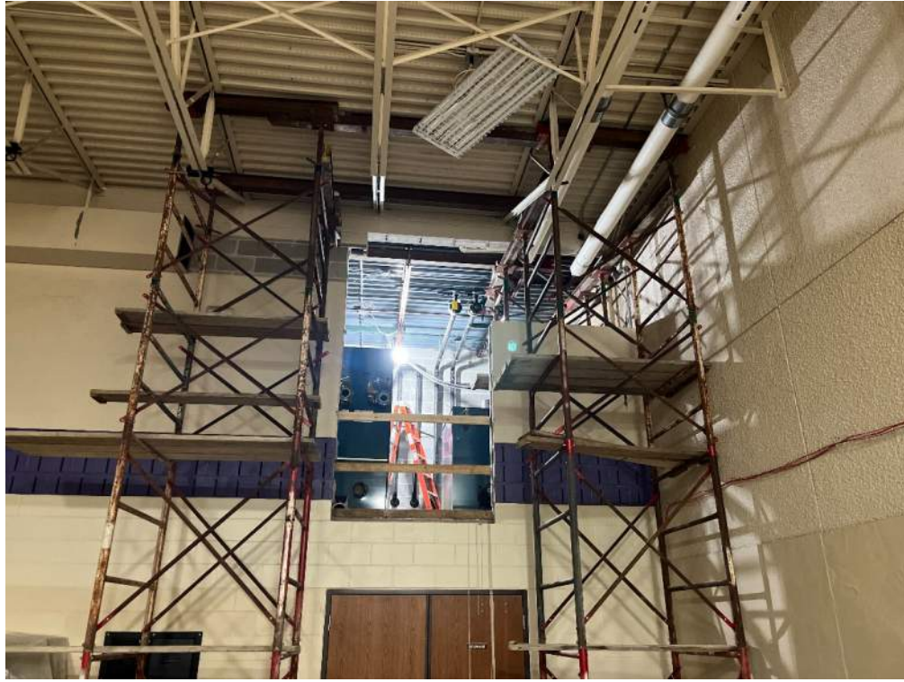
Segment A Existing Art Room – Shoring for Mechanical Equipment Install