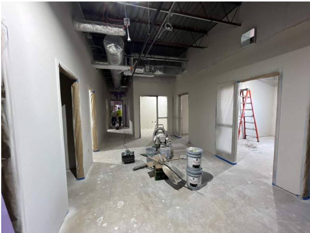
Segment D – School District Admin Area Interior Painting In-Progress