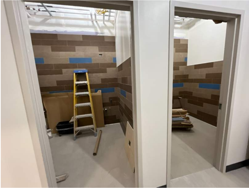
Segment D – B&G Club Admin Area Bathroom Tile Installed