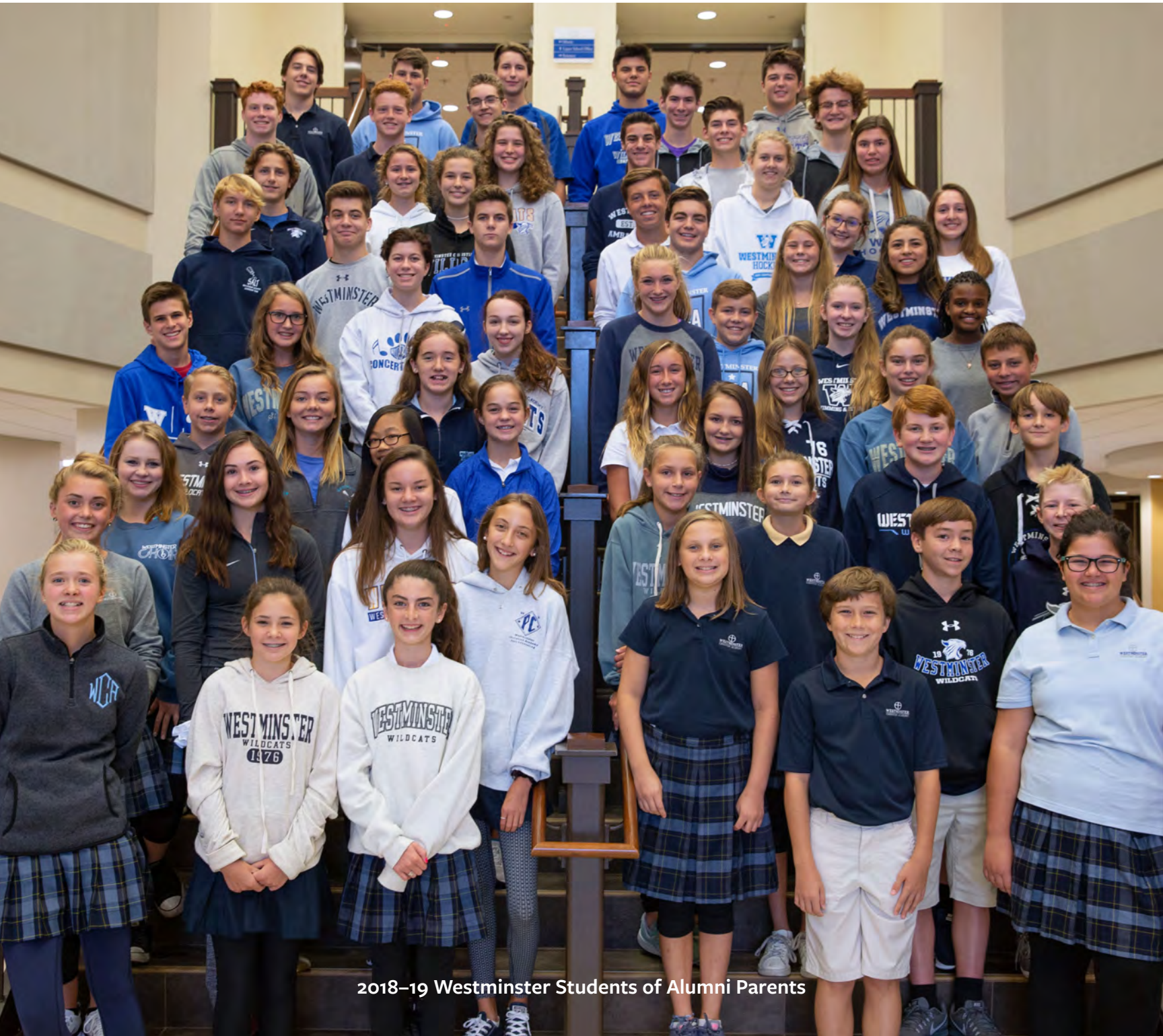
2018-19 Westminster Students of Alumni Parents

Non profit Org. U.S. Postage PAID St. Louis, MO Permit No. 1286