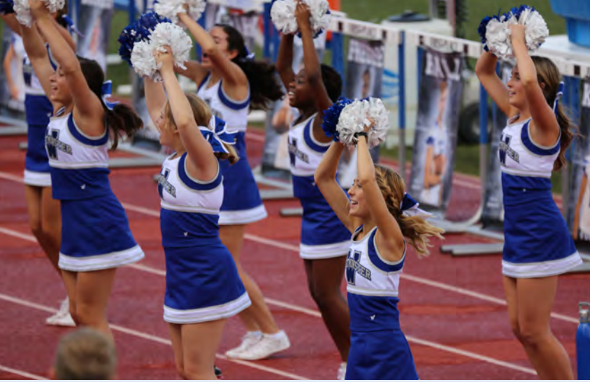
Go Wildcats! The cheer squad rallied fans and encouraged the football team through a tight game against the Rams.