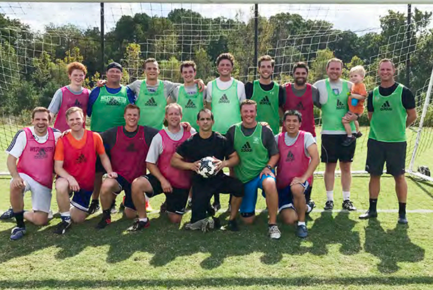
More than 130 alumni made their way back to campus over the weekend to enjoy the festivities, including our annual alumni baseball and soccer games.