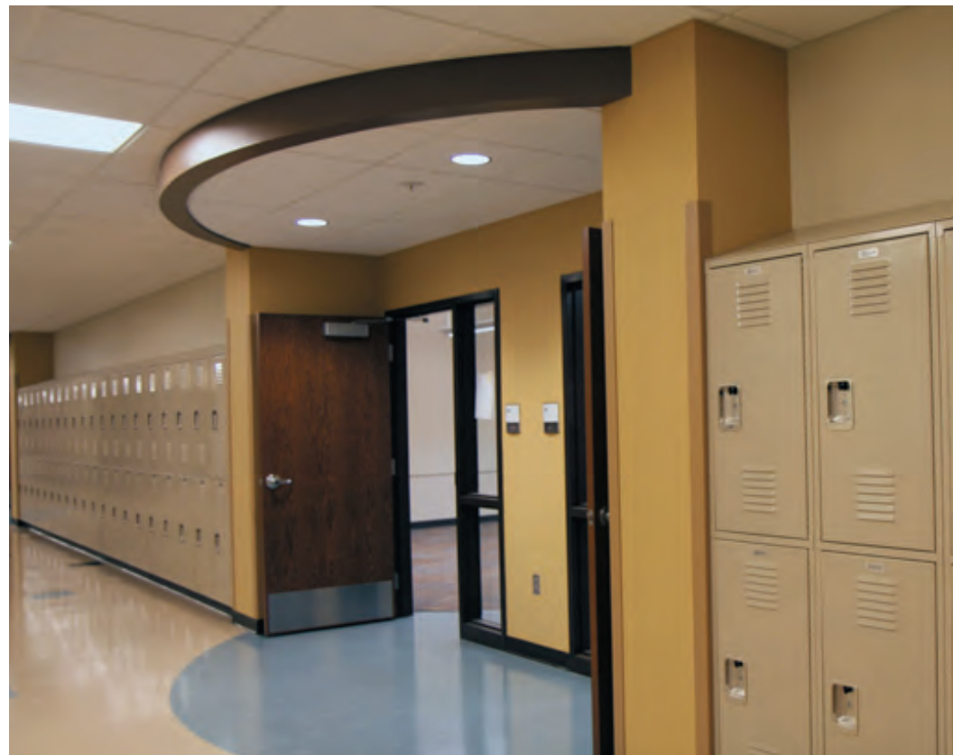
The building contains more than 100 state-of-the-art, technologically advanced classrooms.

By God’s grace, we reached the pledge milestone on December 31, the last