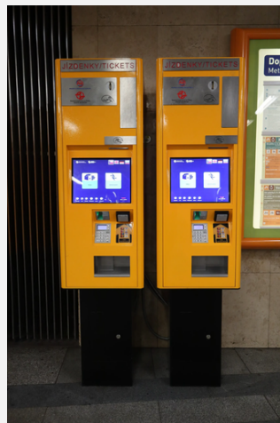
Button ticket machine (Tickets NEED to be further validated) (PID, n.d)