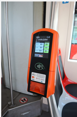
Contactless ticket machine (Tickets do not need to be further validated) (PID, n.d)

Tickets from button or touchscreen ticket machines must be validated (stamped) in a ticket validator before entering the subway platform or immediately after boarding a bus or tram! (pid, n.d)