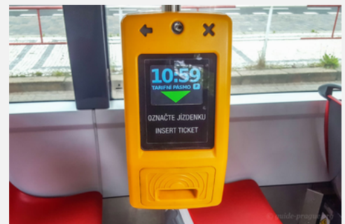
Ticket validator (Prague travel guide, n.d)

To find connections and routes for your travel, you can use the following website of the official Prague transportation system: dpp.cz Alternatively, google maps provides accurate routes and connections as well. Please be aware and make sure to check whether normal operation of public transport is disrupted by scheduled roadwork.